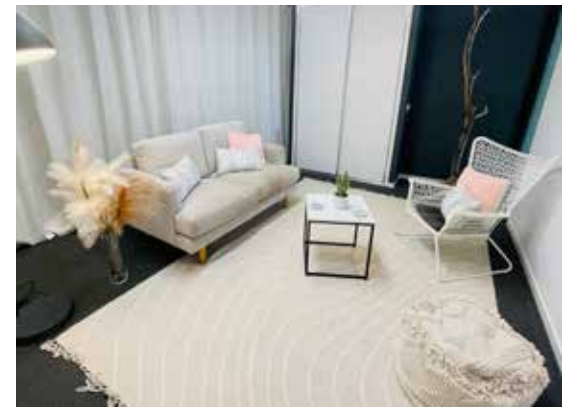
Find solace in the gentle sandy whispers and align with your rhythmic flow.